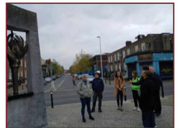
The Praxis Gathering at the "Home" memorial on Buckingham Street, Dublin.

The Vox article can be read on vox.ie and the podcasts found wherever you get your podcasts.